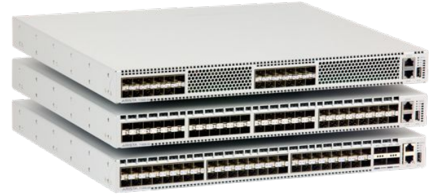
Arista 7150S family

Designed to suit the requirements of demanding environments such as ultra low latency financial ECNs, HPC clusters and cloud data centers, the class-leading deterministic latency from 350ns is coupled with a set of advanced tools for monitoring and controlling mission critical environments.