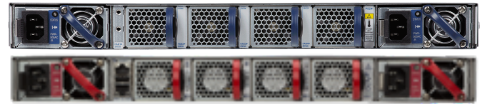
Arista 7050X 1RU Rear View: Rear-to-front airflow model (blue) Front-to-rear airflow (red)