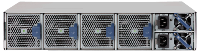
Arista 7050X 2RU Rear View: Rear-to-front airflow model (blue)