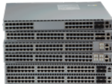
Arista 7050TX Series of 1/10GbE and 10/40GbE Switches

All models in the 7050TX Series delivers rich layer 2 and layer 3 features with wire speed performance up to a maximum performance of 2.56Tbps. The Arista 7050TX switches offer low latency and a shared 12 MB packet buffer pool that is allocated dynamically to ports that are congested. With typical power consumption of less than 5 watts per 10GbE port the 7050TX Series are power efficient. An optional built-in SSD supports advanced logging, data capture and other services directly on the switch. Combined with Arista EOS the 7050X Series delivers advanced features for big data, cloud, virtualized and traditional data center designs.