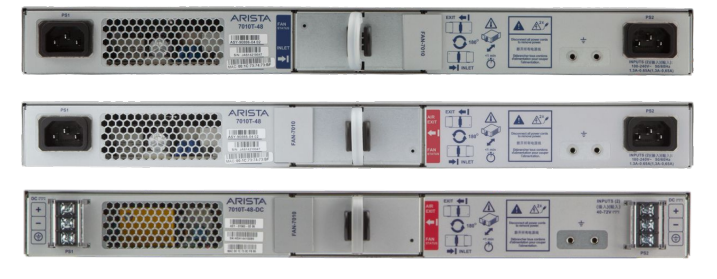
Arista 7010T Rear View - reversible airflow, AC & DC